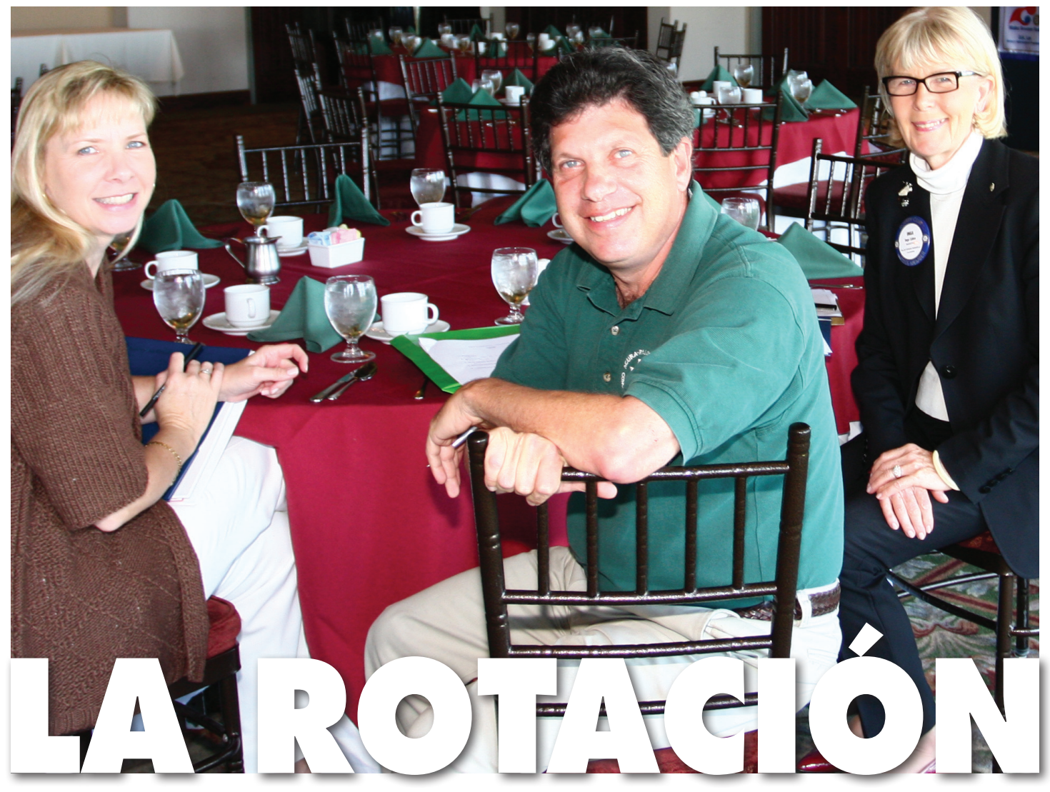
Rotary Club of Palos Verdes Peninsula · April 3, 2009